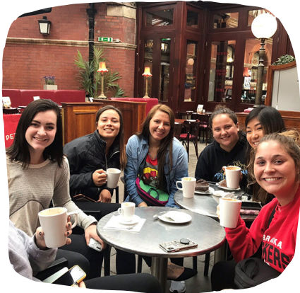
UNO SCCJ students (now alumni) at a London coffee house during London Study Abroad trip.

The mission of the VVSRL is to conduct high quality research related to crime victims and crime victimization, inform policy and practice, and help shape prevention and intervention efforts. Learn more about the impactful VVSRL research at vvsrl.org or through the UNO SCCJ webpage.